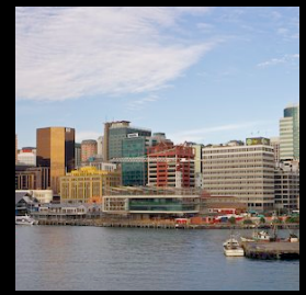
Wellington is our conference city. For hotel information: http://tinyurl.com/3uphkh3